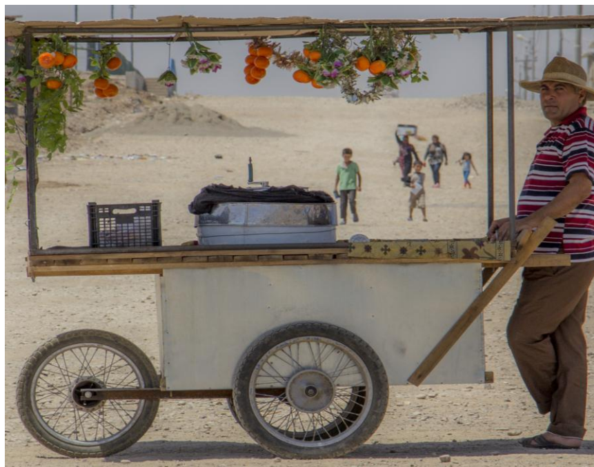
Gawilan Refugee, Dohuk