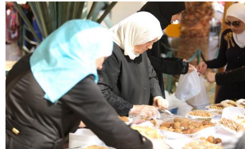
Syrian women displaying their food under livelihood projects, Cairo, Egypt