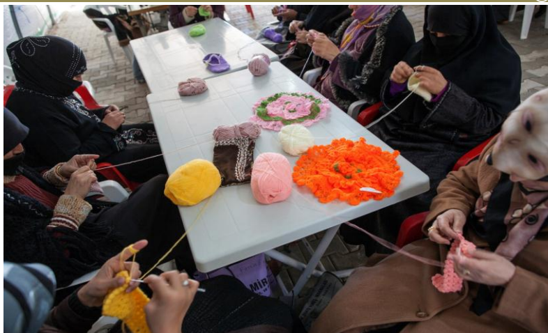
Syrian refugees are benefiting from the vocational training materials provided by UNHCR to training centers in 13 camps as of mid-April 2015. Harran camp, Şanlıurfa, Turkey.

The target groups of the field survey are (i) Syrians under temporary protection off-camps and (ii) related NGOs, public institutions, businessmen associations and chambers in Gaziantep and Şanlıurfa. The survey composed of (ii) face-to-face interviews of a total of 4000 respondents (1992 Males and 2008 Females) from 1000 households and (ii) 24 in-depth interviews with the target groups (6 in Şanlıurfa and 6 in Gaziantep). The exercise has been finalized and reached up to 4000 individuals both in Gaziantep and Şanlıurfa Provinces. The exercise is focusing on industrial and service sector and results of the exercise will feed into the pipeline projects which aims at enhancing vocational and occupational skills of the Syrians under temporary protection and their integration into the local labor markets. The results of the survey have been collated and both qualitative and quantitative detailed analyses will be compiled in a report soon.