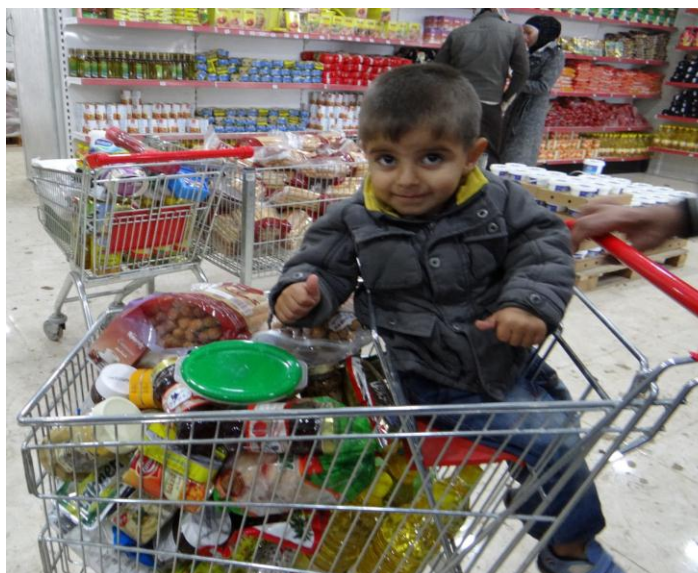
Voucher redemption in Basirma camp, Erbil

Bulgur: 3 kg; Pasta: 4 kg; Lentils: 1.8 kg; Rice: 4 kg; Vegetable Oil: 0.91 kg; Sugar: 1.5 kg; Salt: 0.25 kg and Tomato Paste: 0.80 kg.