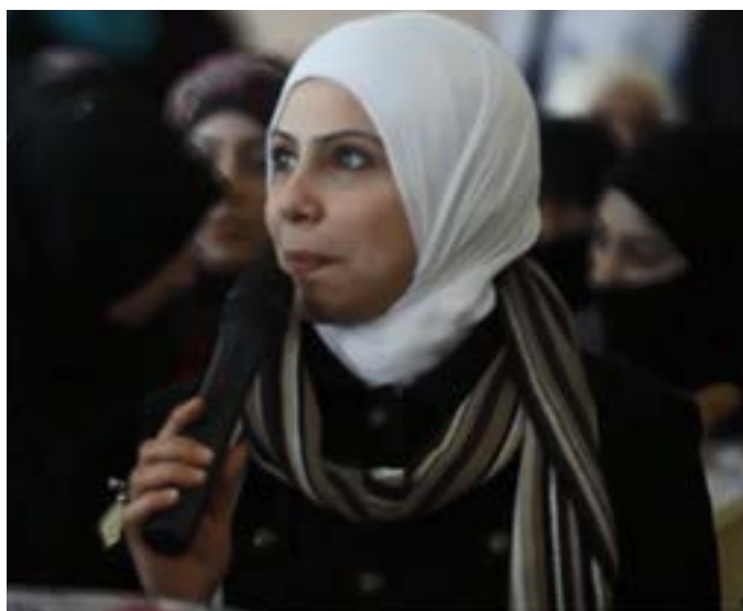
Participants during the volunteerism training held at the Arab Organization for Human Rights.

PRODUCTION OF SUPPORT MATERIALS: As many as 2,000 copies of reproductive health and gender-based violence material were distributed to Syrian refugee youth in Greater Cairo.