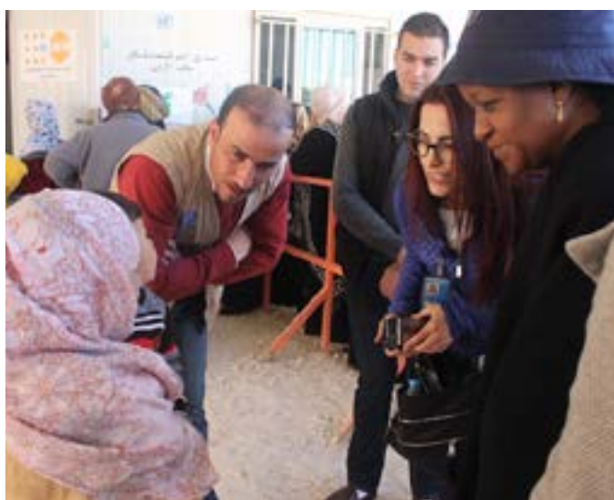
Zeinab Hawa Bangura, Special Representative of the Secretary-General on Sexual Violence in Conflict, (right) talking with a nine year-old girl holding her young sibling in the UNFPA women space during her visit to Zaatari camp in Jordan

"Extremist groups are using sexual violence as a tactic of terror in Iraq and Syria. Sexual violence is fundamental threat to international peace and security and requires operational security and justice responses," said Bangura.