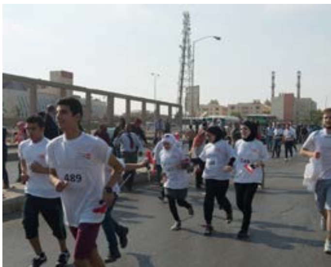
Syrian youth refugees participating in a marathon during the Sports Day in 6th October City in Egypt.