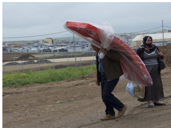
Domiz Refugee Camp, Duhok.