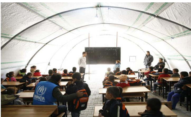
"UNHCR provides support to Turkey in assisting refugees in several technical issues including education as well as core relief item support."

IOM continues with the provision of transportation services for of 1962 (1027 female, 935 male) school children living outside of camps to reach two schools in Sanliurfa (Ayup and Sirrin districts). In Mersin, through the Syria Social gathering NGO, IOM is also supporting 714 students (329 male, 385 female) children to reach the school.