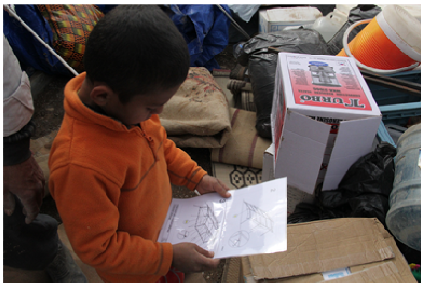
A newly arrived Syrian refugee boy consults the tent instructions.