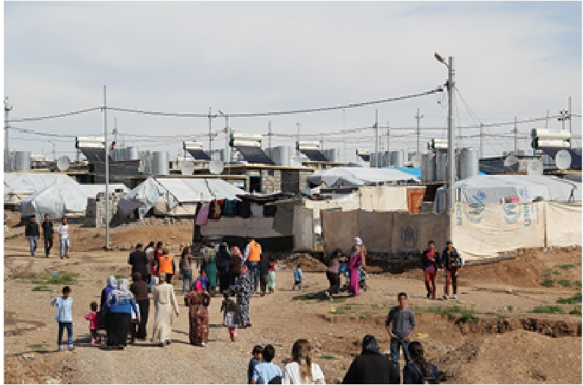
Refugees return to their shelters after a social gathering in the camp hall, Darashakran camp