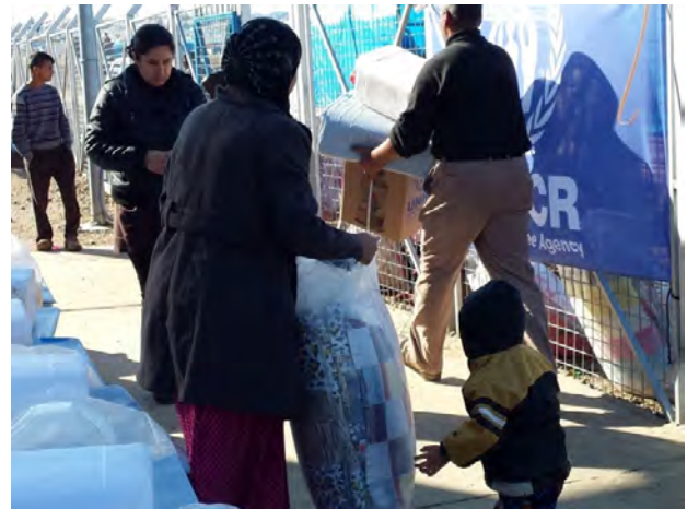
Winterization distribution in Domiz 1 camp