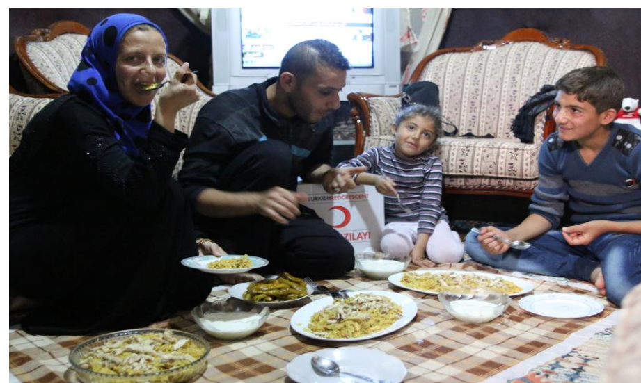
A Syrian refugee family is having a lunch in Boynuyogun camp in Hatay. Syrian refugees can buy food with their WFP/ Turkish Red Crescent's e-food card and cook traditional Syrian meals.

During December, IOM continued to support the soup kitchen run by the municipality in Gaziantep. The food kitchen supports 737 Syrian households (around 4,000 persons) living in urban areas in Gaziantep with one meal per day.