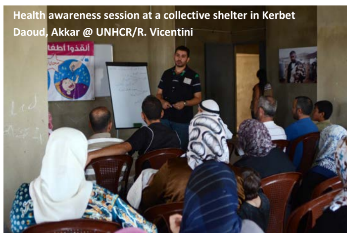
Health awareness session at a collective shelter in Kerbet Daoud, Akkar

Association Justice et Misericorde (AJEM), Caritas Lebanon Migrant Center (CLMC), International Alert, International Medical Corps (IMC), International Orthodox Christian Charities (IOCC), International Relief and Development (IRD) Lebanese Popular Association for Popular Action (AMEL), Makhzoumi Foundation, Première Urgence - Aide Médicale Internationale (PU-AMI), Restart Center, the United Nations Children's Fund (UNICEF) and the World Health Organization (WHO).