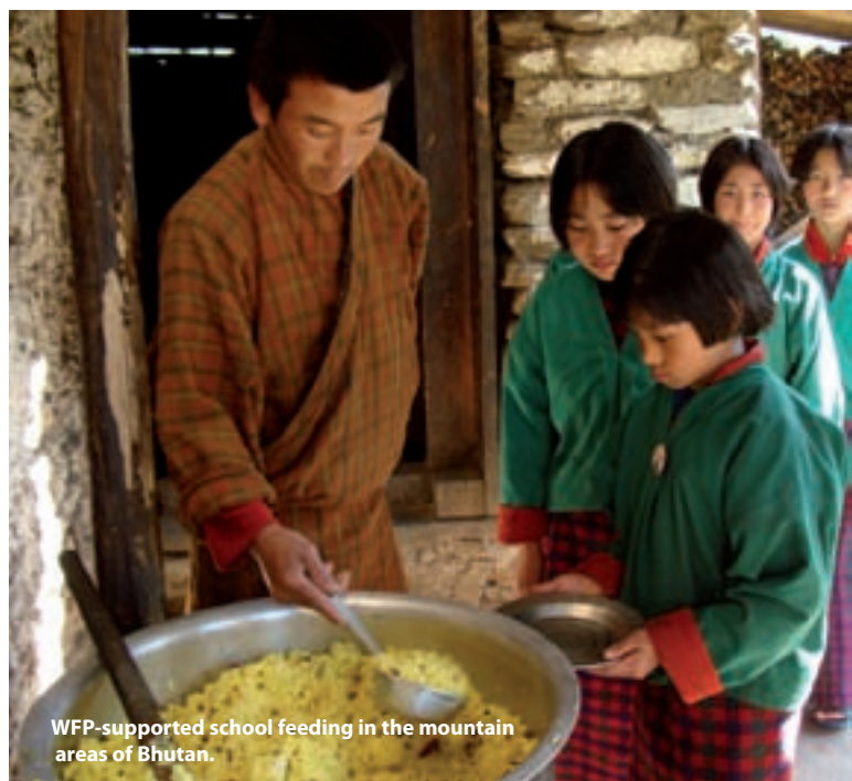
WFP-supported school feeding in the mountain areas of Bhutan.

14. Achieving gender balance in staffing remains a challenge, particularly in managerial positions. 2 This is addressed in WFP's human resource strategy. 13