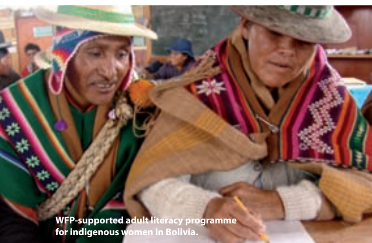
WFP-supported adult literacy programme for indigenous women in Bolivia.