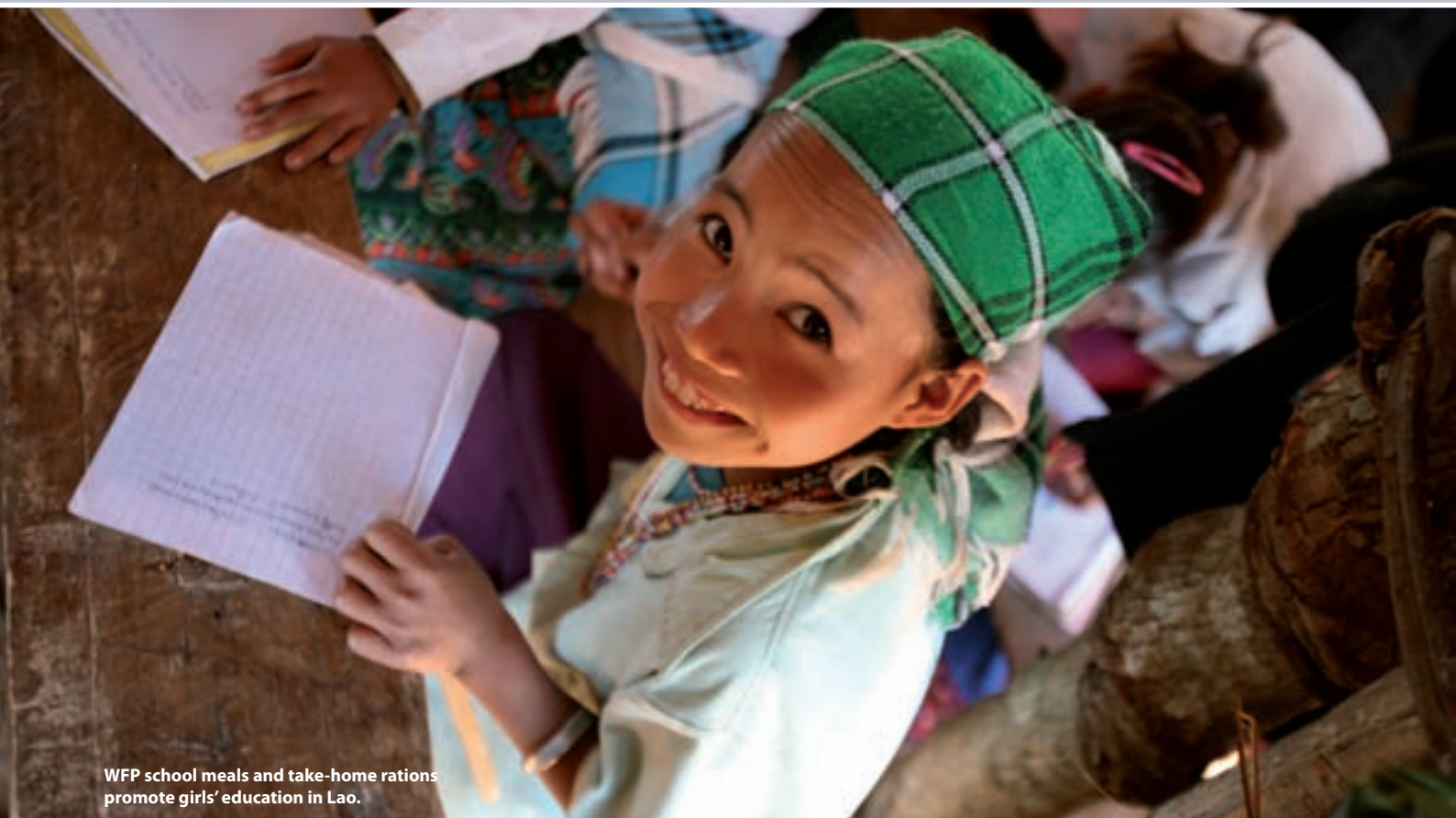
WFP school meals and take-home rations promote girls' education in Lao.

childcare will be considered in the design to improve women's access to the benefits; and iii) that a monitoring system is put in place to ascertain whether women are empowered in terms of decision making and of benefiting from WFP assistance to improve their livelihoods; the system should include qualitative data.