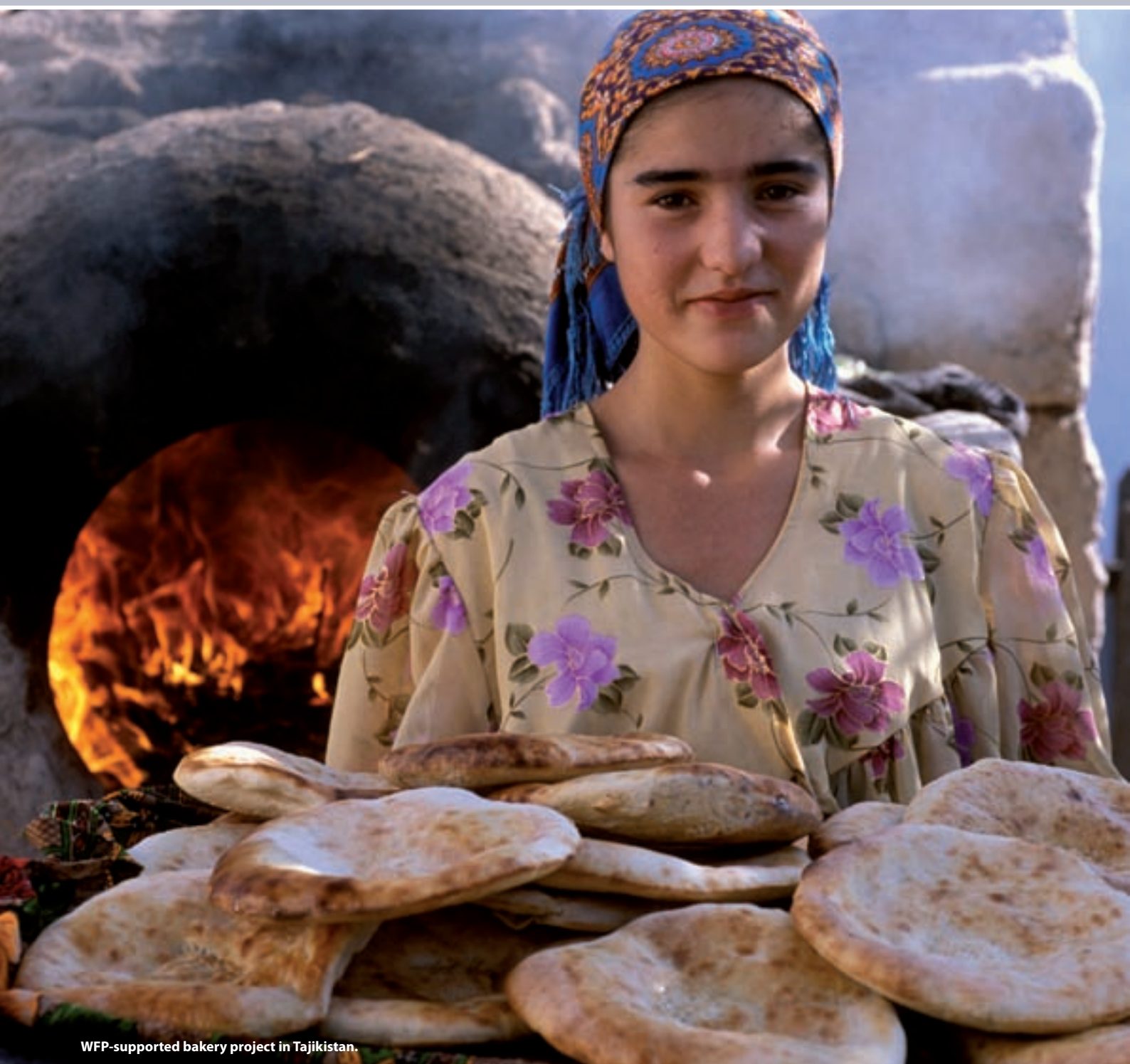
WFP-supported bakery project in Tajikistan.

study of violence against women sets out its forms, consequences and costs. 9