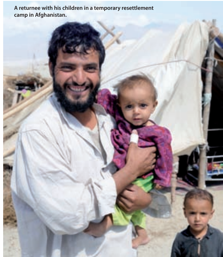
A returnee with his children in a temporary resettlement camp in Afghanistan.