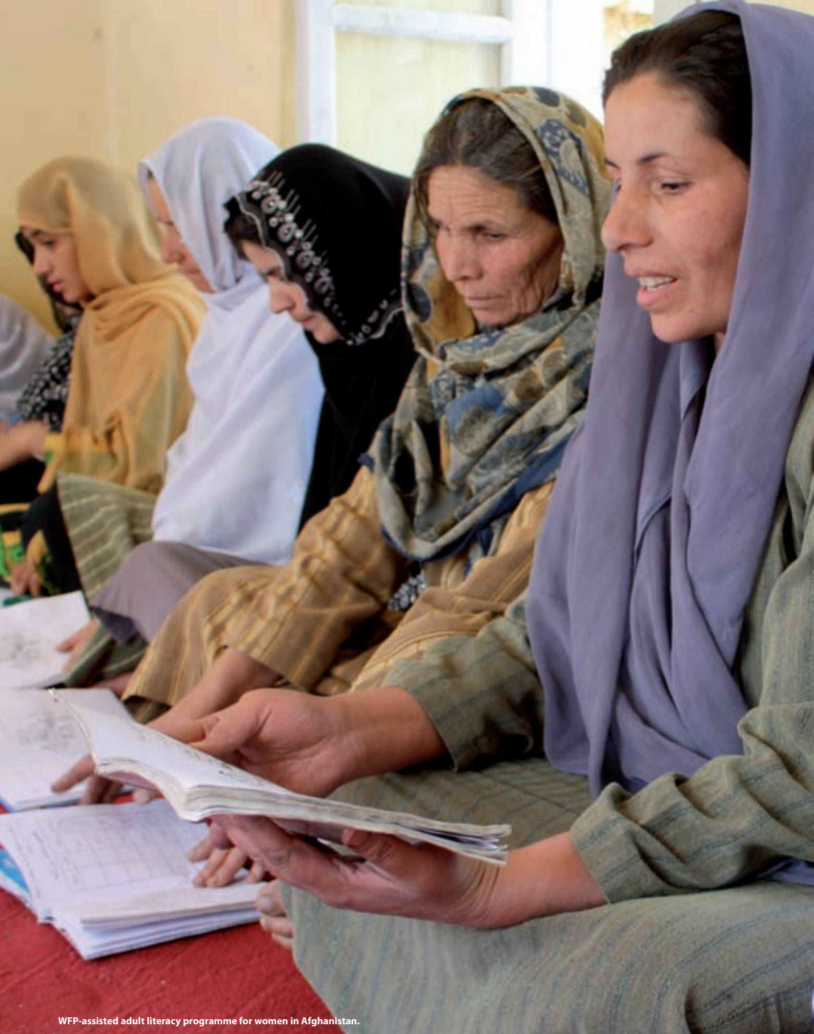
WFP-assisted adult literacy programme for women in Afghanistan.