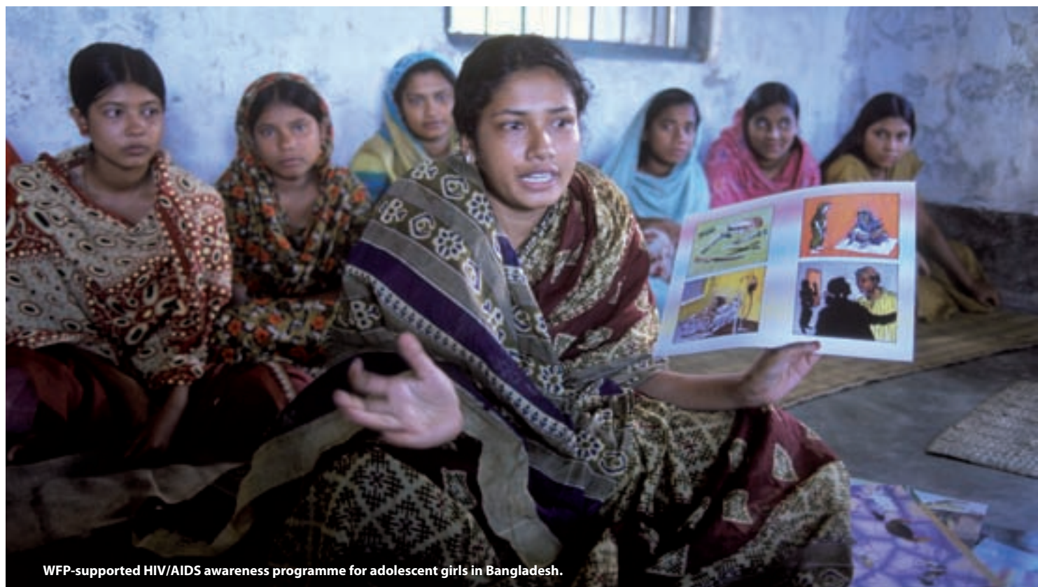
WFP-supported HIV/AIDS awareness programme for adolescent girls in Bangladesh.

evaluation tools, the Indicator Compendium , the Performance and Competency Enhancement programme and the Strategic Results Framework; senior managers will provide leadership and have primary responsibility for implementing this gender policy; ii) promote accountability for gender mainstreaming among its partners through field-level agreements and Memoranda of Understanding; iii) strengthen its monitoring and evaluation systems to measure and report on progress in mainstreaming gender; and iv) enforce and monitor its policy on sexual harassment and abuse of power, including its executive directives on sexual exploitation and abuse