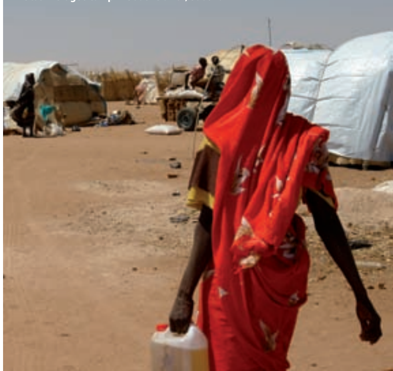
Otash refugee camp in South Darfur, Sudan.

and be heard concerning food and nutrition security.