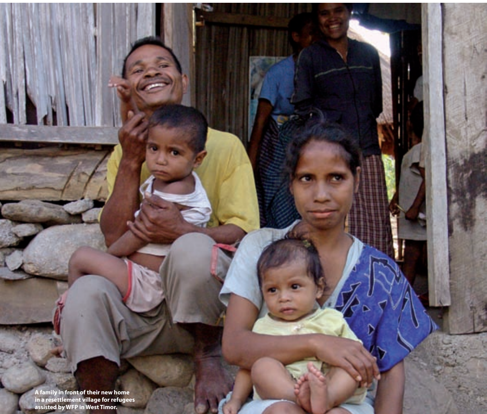
A family in front of their new home in a resettlement village for refugees assisted by WFP in West Timor.

specialist staff and capacity development and will, within its funding capacity, provide resources for gender mainstreaming. WFP will also seek extra-budgetary resources to address funding gaps.