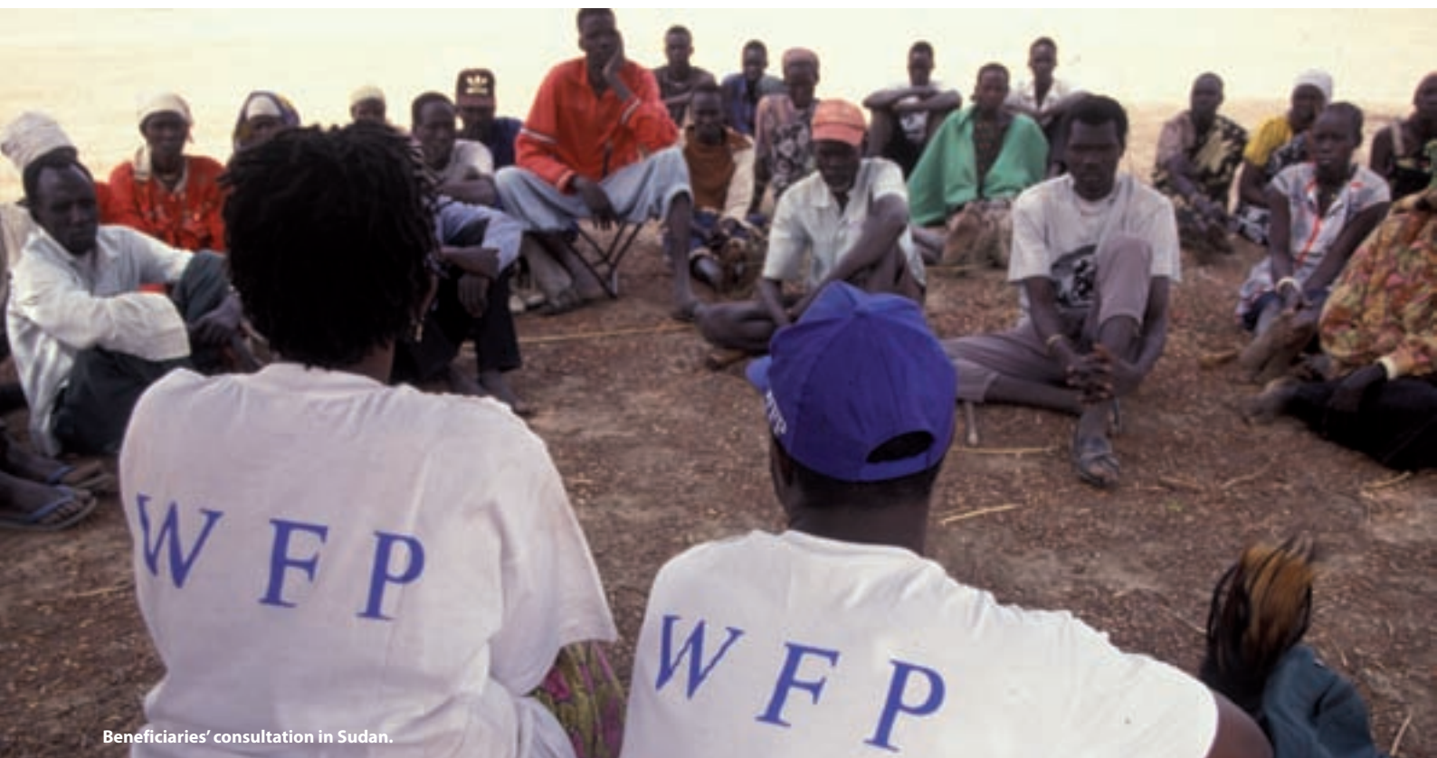
Beneficiaries' consultation in Sudan.