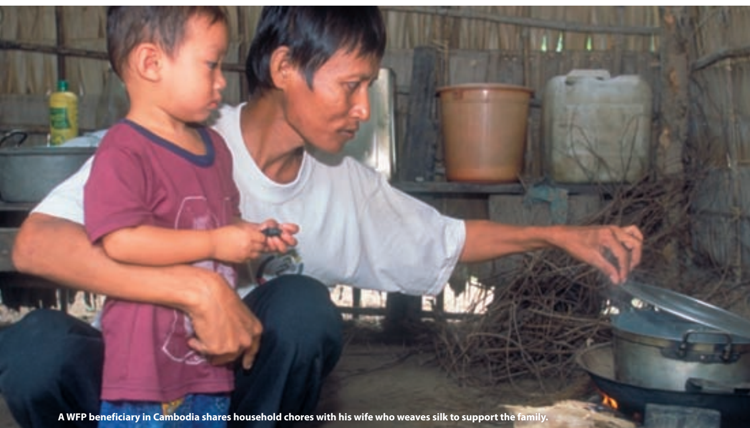
A WFP beneficiary in Cambodia shares household chores with his wife who weaves silk to support the family.