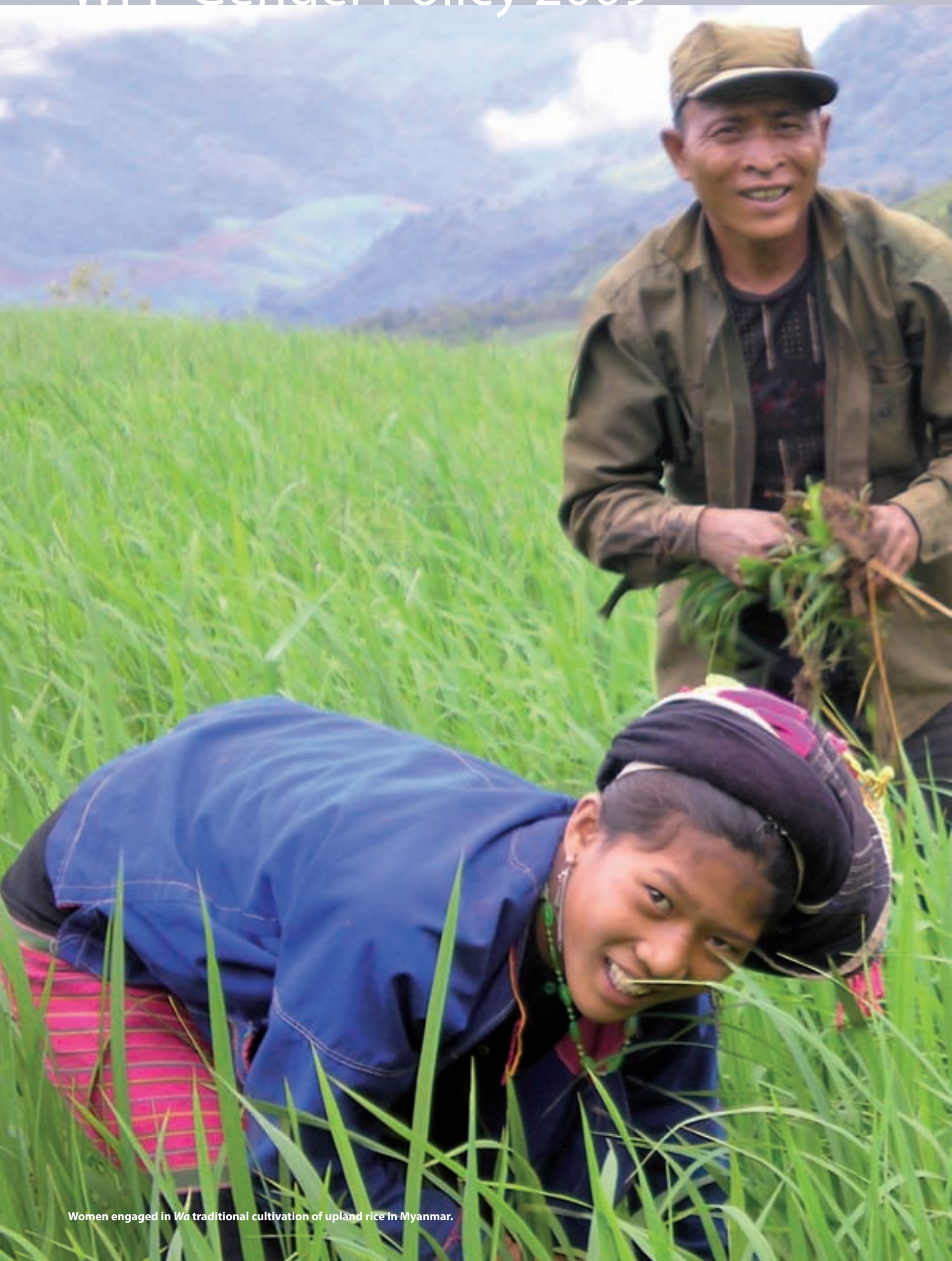
Women engaged in Wa traditional cultivation of upland rice in Myanmar.