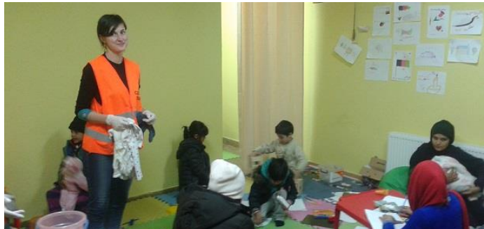
Children playing in the child friendly space facilitated by Czech volunteers, Šid (Serbia), ©UNHCR, 30 November 2015

The SCRM received 52 bunk beds donated by IKEA with 208 mattresses at Principovac RAP. 35 beds were assembled and 17 are in the warehouse in Principovac.