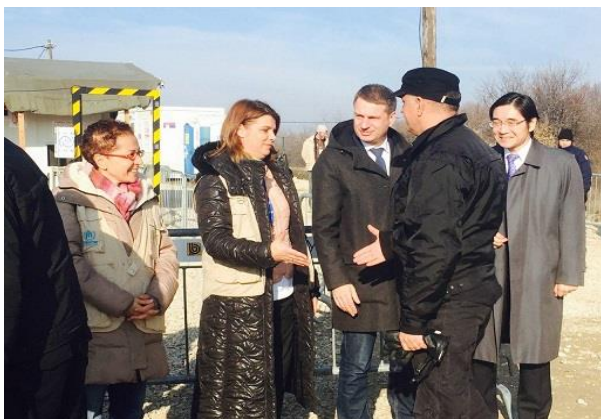
The delegation from the Japanese Embassy in Serbia visiting the Preševo RC and Miratovac RAP, Miratovac (Serbia), ©UNHCR, 18 December 2015

Police, IOM, Philanthropy, REMAR, Medical Centre UNHCR, MSF and UNICEF are resuming their presence at the new RAP.