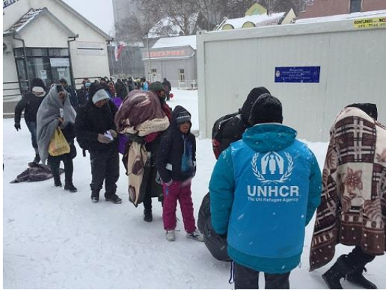
Boarding the train for Croatia, Sid (Serbia), ©UNHCR, 3 January 2016

11,365 asylum seekers departed by train to Croatia during the reporting period.