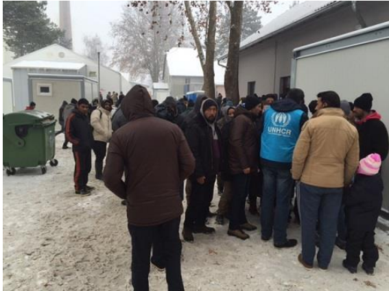
UNHCR staff providing information to asylum seekers, Šid (Serbia), 5 January 2016

At the Sid Train Station and RAP asylum seekers stayed inside the available heated facilities while waiting for boarding. UNHCR/HCIT assisted them prior to and during the boarding, and distributed 135 UNHCR blankets, 1,000 WFP HEB, 552 water bottles, 270 jackets, 25 boots and 20 UNHCR bags.