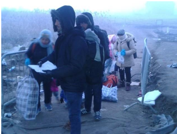
Documentation of new arrivals checked at the Border Police point at Tabanovce/Miratovac, Miratovac (Serbia), ©UNHCR, 28 January 2016

1,836 refugees and migrants were assisted at the Miratovac Refugee Aid Point (RAP) upon arrival from fYRo Macedonia. Arrivals were slowed down during the night and resumed in the early morning.