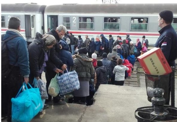
Asylum seekers boarding the train to Croatia, Šid (Serbia), ©UNHCR, 31 January 2016

Croatian authorities denied boarding to of trains in approximately 321 instances, mostly to young men from Morocco, many of whom had and continued to try getting on these trains several times. Even a small number of asylum seekers from Syria, Iraq and Afghanistan were denied boarding. The SCRM accommodated them in the Sid RAP.