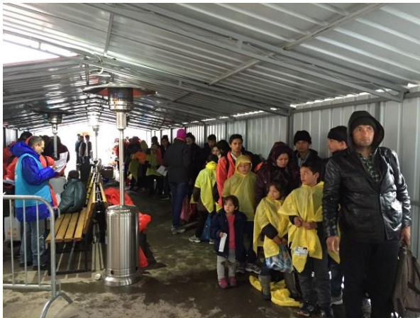
Roofed waiting area protected asylum seekers from the rain, Šid (Serbia), ©UNHCR, 10 February 2016

2,578 refugees departed to Croatia on three trains. 113 were denied boarding by Croatian authorities and placed in the Sid RAP.