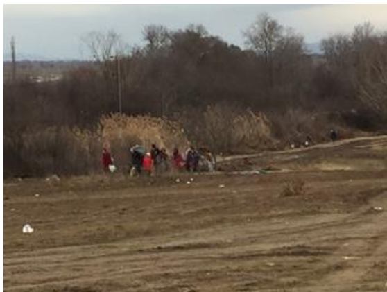
New arrivals crossing from fYRo Macedonia to Serbia, Miratovac, (Serbia), 2 February 2016

Police, Gendarmerie, IOM, Philanthropy, Remar, Medical Center, UNHCR, MSF, DRC, World Vision, were active at the RAP. UNHCR/DRC/SPDE distributed 182 winter boots, 12 jackets and water bottles, while UNICEF and Philanthropy/CRS distributed other non-food items.