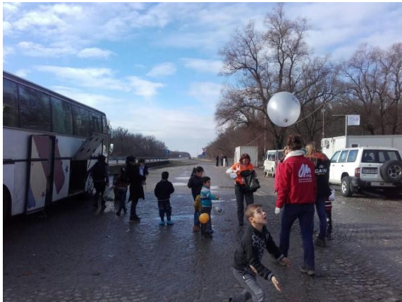
A fair day in Adaševci, ©UNHCR, 1 February 2016

At the Sid Train Station, UNHCR/HCIT distributed 15 UNHCR blankets, 500 WFP HEB, 744 water bottles, 48 winter jackets, boots, and 50 UNHCR bags.