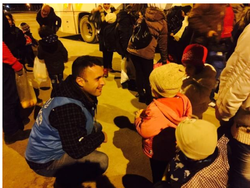
Newly arrived asylum-seekers with children, Preševo (Serbia), 16 February 2016

Police, Gendarmerie, IOM, Philanthropy, Remar, Medical Center, UNHCR, MSF, DRC, World Vision, were assisting them at the RAP. UNHCR/DRC/SPDE distributed three winter boots, UNHCR blankets and water bottles, while UNICEF and Philanthropy/CRS distributed other non-food items (NFIs).