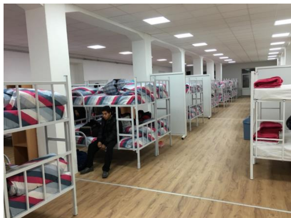
Tobacco factory phase I in use, Preševo (Serbia), ©UNHCR, 1 March 2016

Police, Gendarmerie, IOM, Philanthropy, Remar, Medical Center, UNHCR, MSF, DRC, World Vision and Indigo were assisting them at the RAP.