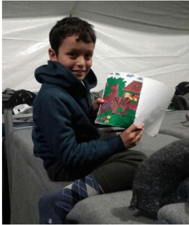
A refugee boy proud of his drawing, Šid (Serbia), 3 March 2016

As no train arrived from Croatia to Šid, there were no departures.