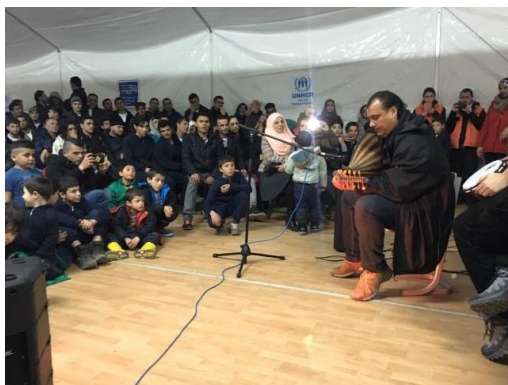
A song contest was organised in the Reception Centre in cooperation with the Youth for Refugees, Preševo (Serbia), 5 March 2016

569 refugees from Syria and Iraq were assisted at the Miratovac Refugee Aid Point (RAP) upon arrival from fYR Macedonia.