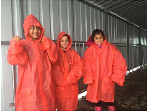
Syrian children in raincoats donated by UNHCR, Adaševci (Serbia), ©UNHCR, 10 March 2016

Over 500 refugees continued to stretch the capacities of the Sid RAP. UNHCR/HCIIT distributed 116 UNHCR blankets, 100 WFP HEB, 984 water bottles, ten winter jackets and 15 raincoats. IDC/Sid Health Centre and WAHA treated over 55 refugees.