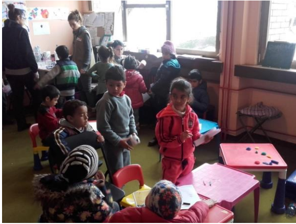
New UNICEF/WV/CSW child friendly space in Adaševci (Serbia), ©UNHCR, 13 March 2016

517 refugees from Afghanistan, Iraq, Syria and Iran continued to stretch the capacities of the Refugee Aid Point (RAP, "Grey House") in Sid.