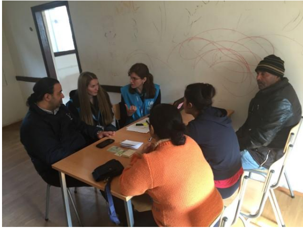
UNHCR with refugees in the Šid RAP, Šid (Serbia), ©UNHCR, 29 March 2016

Less than 500 refugees were hosted in the three sites in the west where UNHCR started the individual protection assessments.