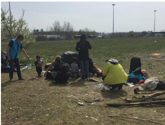
UNHCR/HCIT teams visiting asylum-seekers at the border with Hungary, Horgoš (Serbia), ©UNHCR, 4 April 2016

UNHCR/HCIT border monitoring teams interviewed and assisted asylum-seekers waiting to enter Hungary near Horgos and Kelebija border crossings.