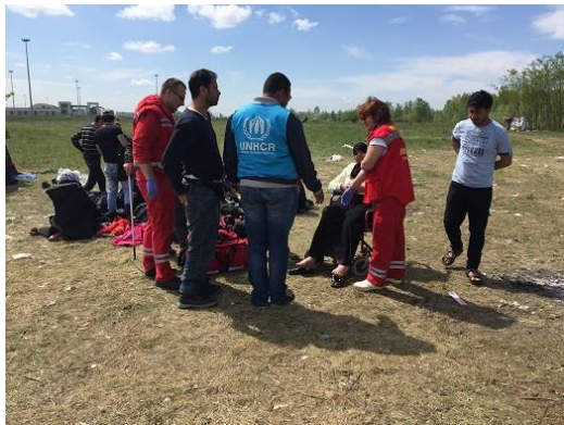
Kanjiža medical team assisting an asylum seeker, Horgoš (Serbia), 14 April 2016

155 asylum seekers, including many women and children, waited outside the two "transit zones" near Kelebije and Horgos I border-crossings. They arrived from the sites in the West or had entered Serbia irregularly from FYR Macedonia or Bulgaria and reached the North through Belgrade. Some 30 asylum seekers were admitted into each "transit zone". UNHCR/HCIT distributed food, 348 water bottles and 100 raincoats. An ambulance from Kanjiža Hospital assisted one woman in the open at Horgos border crossing. Access to sanitary facilities still needs to be resolved.