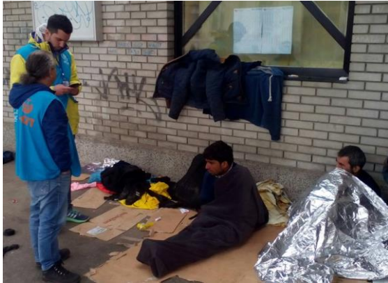
HCIT team assisting refugees/migrants outside Subotica bus station, Subotica (Serbia), ©HCIT, 2 May 2016

Between 231 and 317 asylum seekers, including many women and children, waited outside the two “transit zones” near Kelebija and Horgos I border crossings every day. Another close to new arrivals from Greece were observed near Subotica on 1 May.