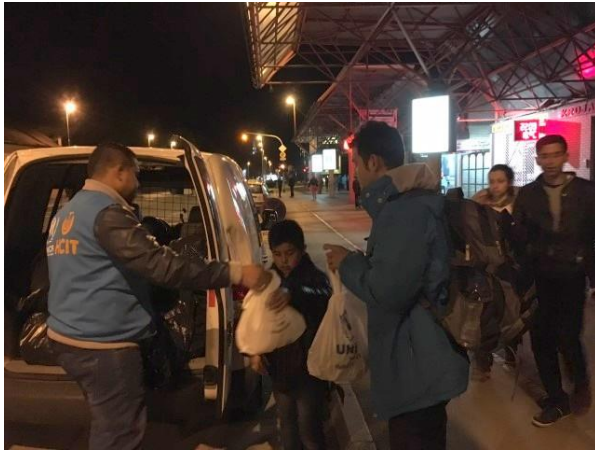
Distribution of aid to refugees/migrants at the bus station in Subotica, Subotica (Serbia), ©HCIT, 6 May 2016

On a daily basis over 270 asylum seekers, including many women and children, waited to be admitted into the two “transit zones” at Kelebija and Horgos I border crossings. In both sites the sanitary conditions remain a serious concern, despite the continued advocacy from the humanitarian community. The requests to re-admit HCIT team at the sites and place chemical toilets are pending the approval from the authorities.