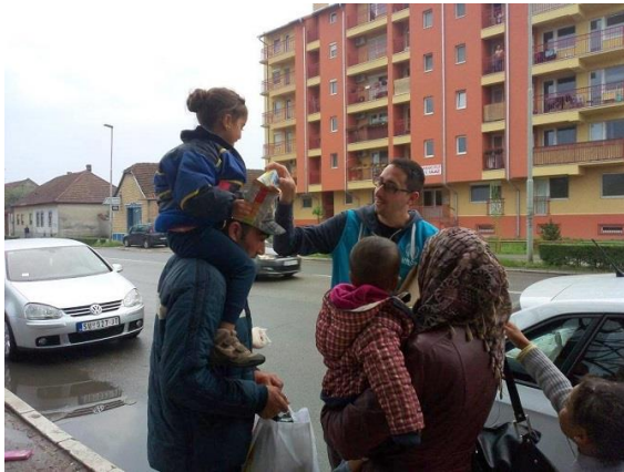
Distribution of aid packages at the bus station in Subotica, Subotica (Serbia), 10 May 2016

On a daily basis an average of 220 asylum seekers, including many women and children, waited to be admitted into the two “transit zones” at Kelebija and Horgos I border crossings. 122 asylum seekers departed by accessing Hungarian “transit zones” while Hungarian authorities returned 15 single men to Serbia.