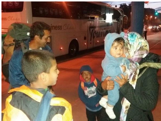
New arrivals in Subotica bus station, Subotica (Serbia), @HCIT, 17 May 2016

On average 418 asylum seekers, waited to be admitted into the two “transit zones” at Kelebija and Horgos I border crossings. Of those, 23% were women and 41% were children. Numbers in both sites increased after the Hungarian authorities recently decreased daily admission from some 30 to some 15 asylum seeker per “transit zone”.