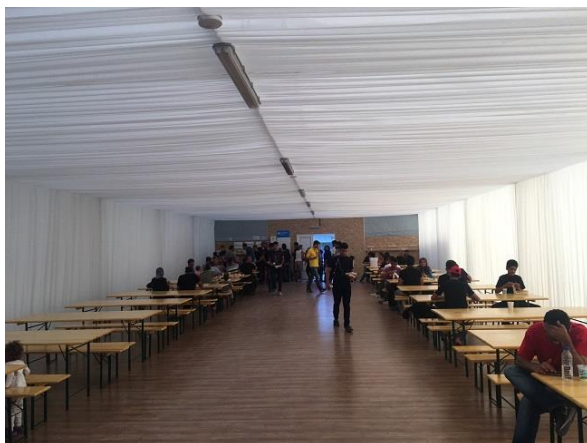
Dinner in the MSF rub hall in the Reception Centre in Prešovo, Prešovo (Serbia), 31 May 2016

The Reception Centre (RC) in Presevo accommodated between 87 and 100 refugees during the reporting period. In addition, 62 new arrivals, many arriving in bad state and exhausted, were also temporarily accommodated there before departing to assigned asylum centres.