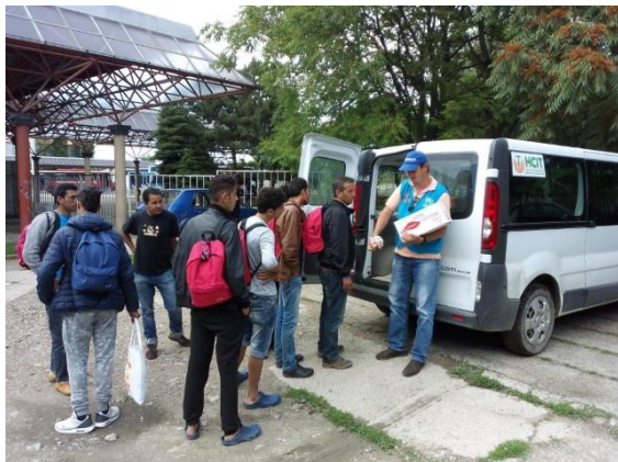
Distribution of aid outside the main bus station in Subotica, Subotica (Serbia), @HCIT, 14 June 2016

About 600 asylum seekers, stayed for days and some for weeks in improvised tents outside the "transit zones" at Kelebija and Horgos I border crossings. Sanitary conditions at the border crossings were mitigated by authorities installing more chemical toilets in each site, while garbage collection and disposal remained challenging, especially in Kelebija.