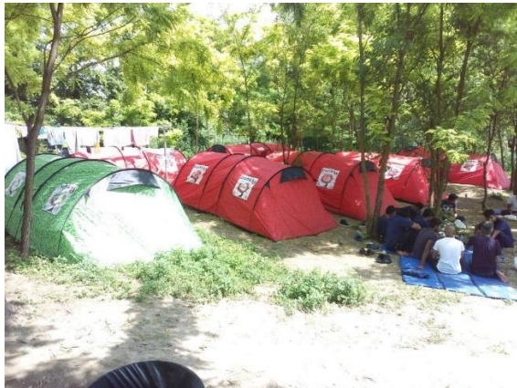
Tents outside the Refugee Aid Point (RAP) of Subotica, Subotica (Serbia) 24 June 2016

On average, over 660 asylum seekers were present close to the Hungarian border every day. With no modus-operandi of admission and waiting yet established between Hungarian and Serbian authorities, the situation at the border remains potentially explosive, leading to frustration and tensions amongst asylum-seekers and too many dangerous irregular crossings.