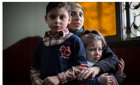
Syrian woman with her children attending an awareness session

The operational capacity of partners remains largely concentrated in Greater Cairo and to some extent Alexandria, affecting services to most vulnerable, including (SGBV) survivors, children at risk and disabled in particular. Challenges remain in identifying specialized national services and coverage of major and smaller urban centers around the country.