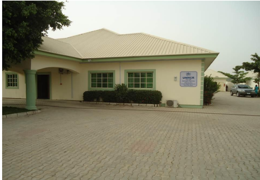
(Photo: Building hosting UNHCR SO Bauchi located at A5Yakubu Maigari Road in the Bauchi metropolis 16 March 2015)