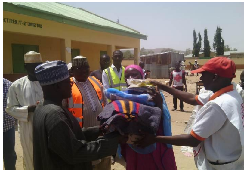
Photo: UNHCR and Partners NRCS distributing NFIs in Bauchi State 21 April