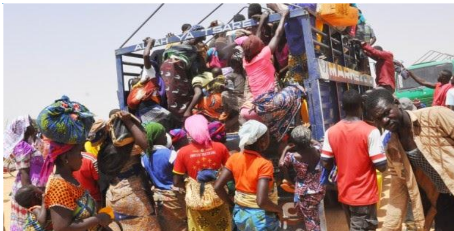
Nigerian returnees from Niger Republic scrambling for space in an open lorry. Photo: NEMA, May 6 2015