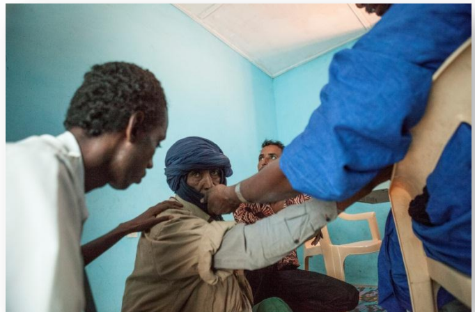
Man undertakes biometric enrolment.