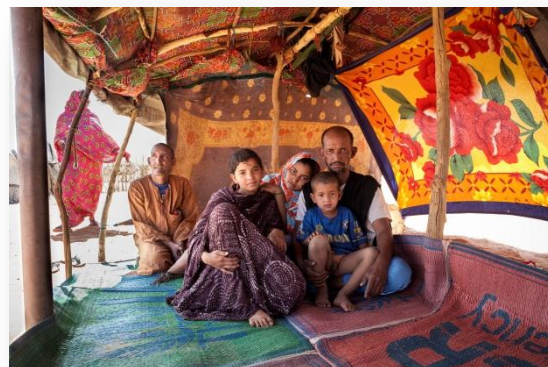
Family portrait in Mberra camp.