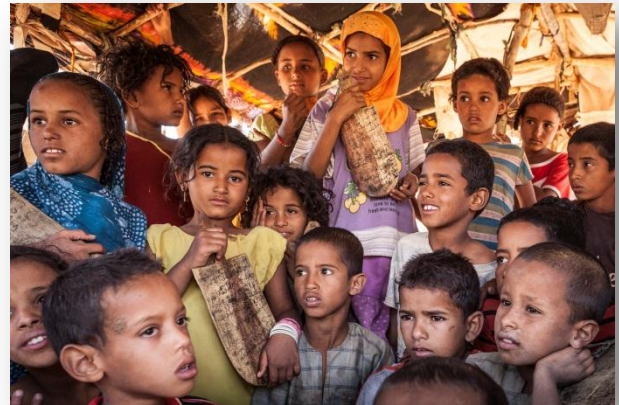
UNHCR promotes education for all in Mberra camp.