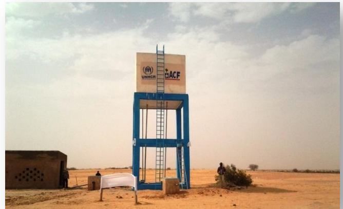
Inauguration of the water tower in Mberra village