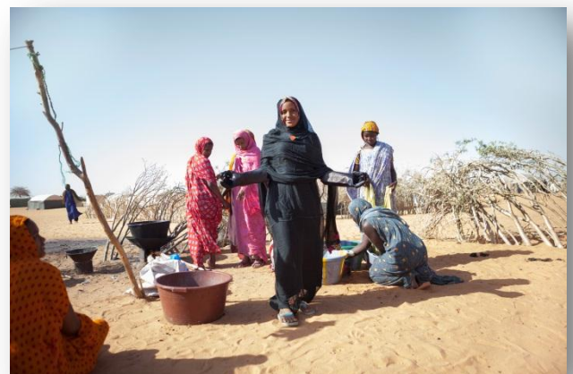
Women during food preparation in Mberra Camp.