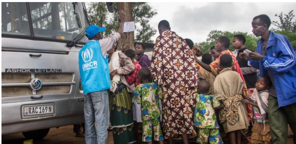
UNHCR staff in Bugesera RC assisting refugees for relocation to Mahama camp.