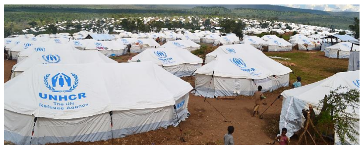
Mahama refugee camp