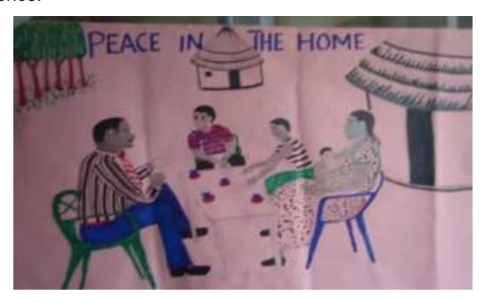
Community drawing: interpretation of violence free home