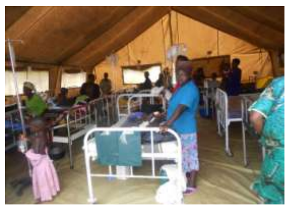
Inpatient ward at the Health Centre - Rwamwanja Refugee Settlement, December 2012