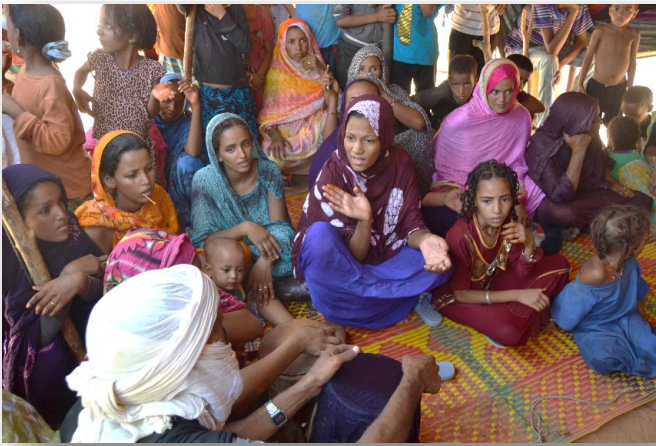
Raising awareness is the key to prevent waterborne diseases in Mberra Camp.