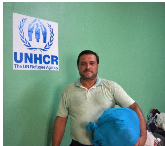
Distribution of UNIQLO clothes to refugees in Nouakchott