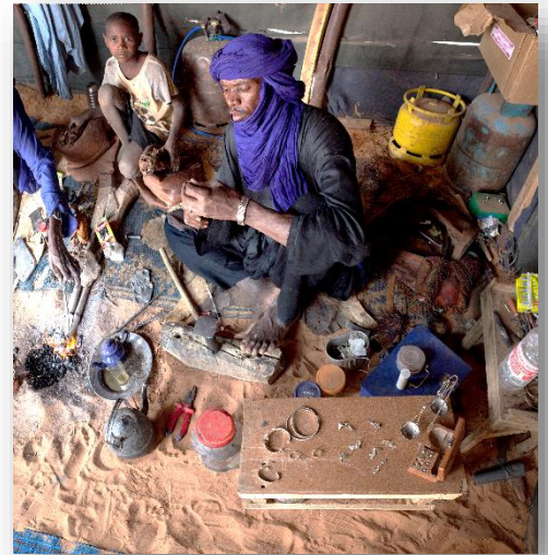
Jewellery making in Mberra Camp.