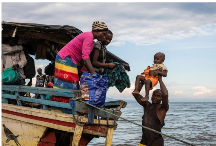
Burundian refugees arrive at Mboko, DRC, by boat.