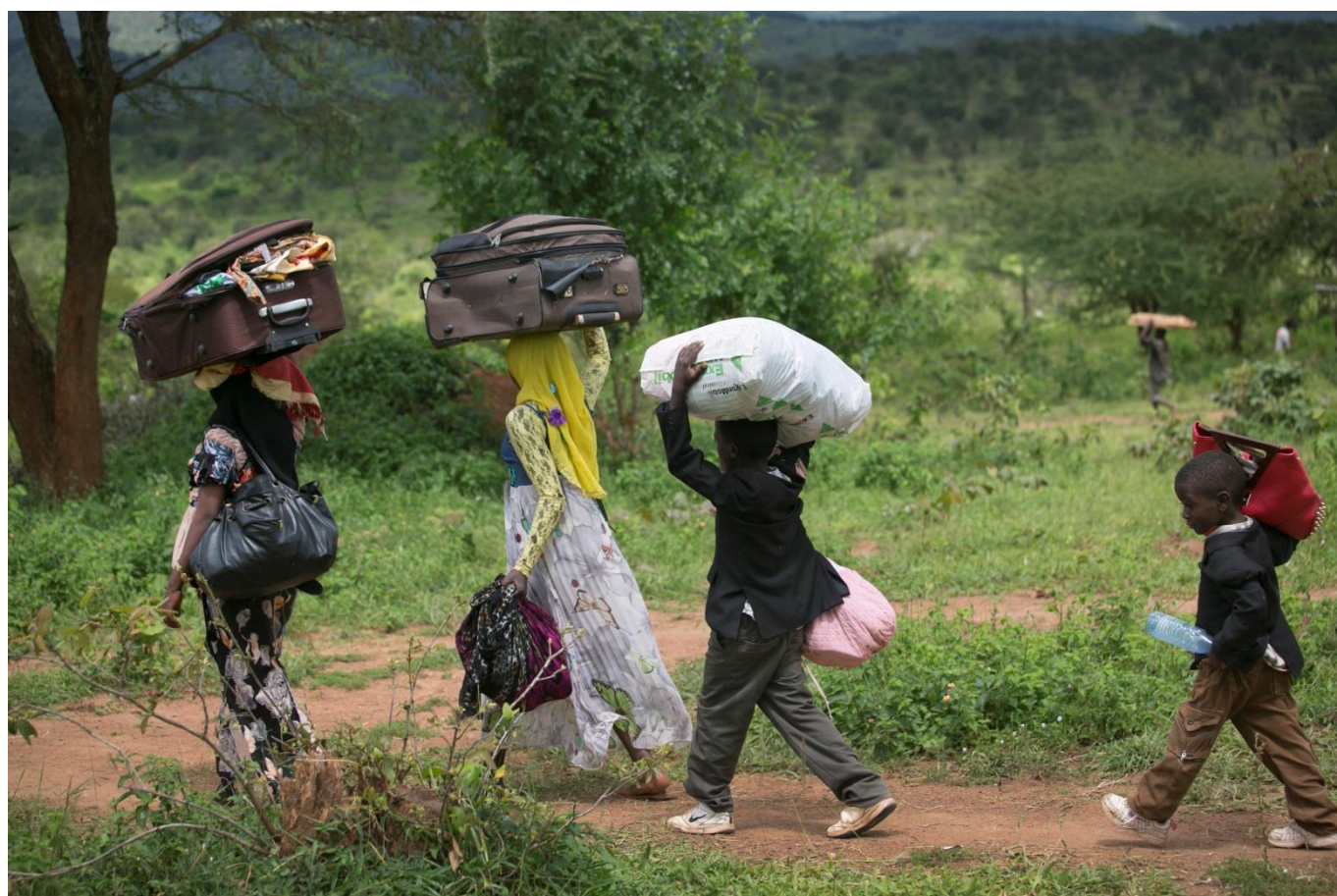
A Burundian family head towards their tent with their belongings in Mahama refugee camp, Rwanda.