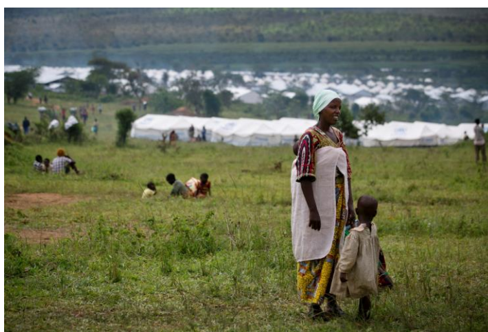
A Burundian woman and her children in Mahama refugee camp.