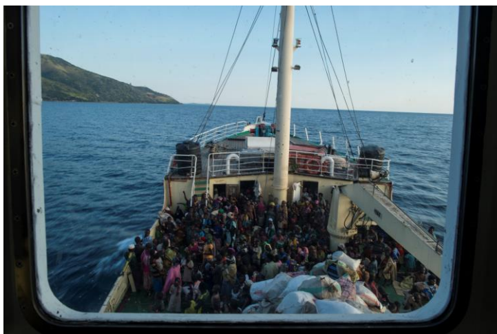
Burundian refugees on the front deck of the MV Liemba being transferred from Kagunga to Kigoma, from where they will be transported to Nyarugusu refugee camp.