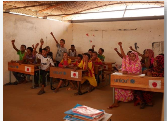
A classroom in Mberra Camp.