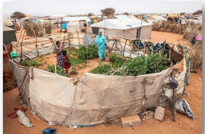
Gardening at a household in Mberra Camp.