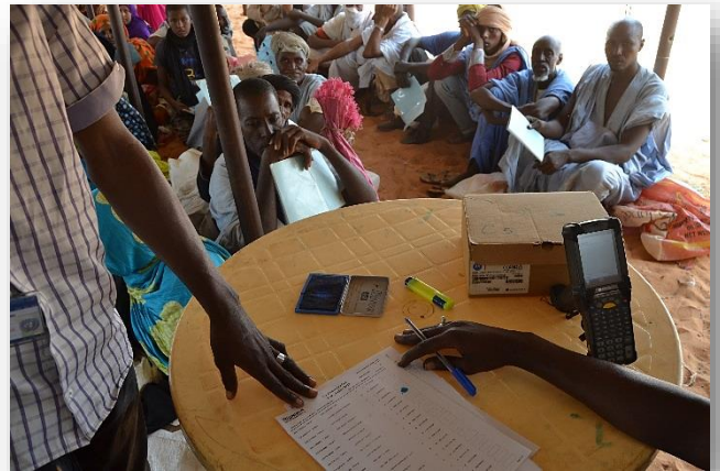
General Food Distribution in Mberra Camp.