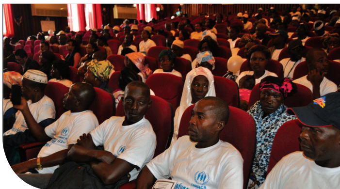
Some former S. L. refugees became Liberian citizens on World Refugee Day