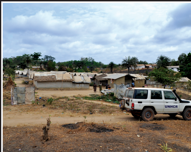
Saclepea Refugee Settlement