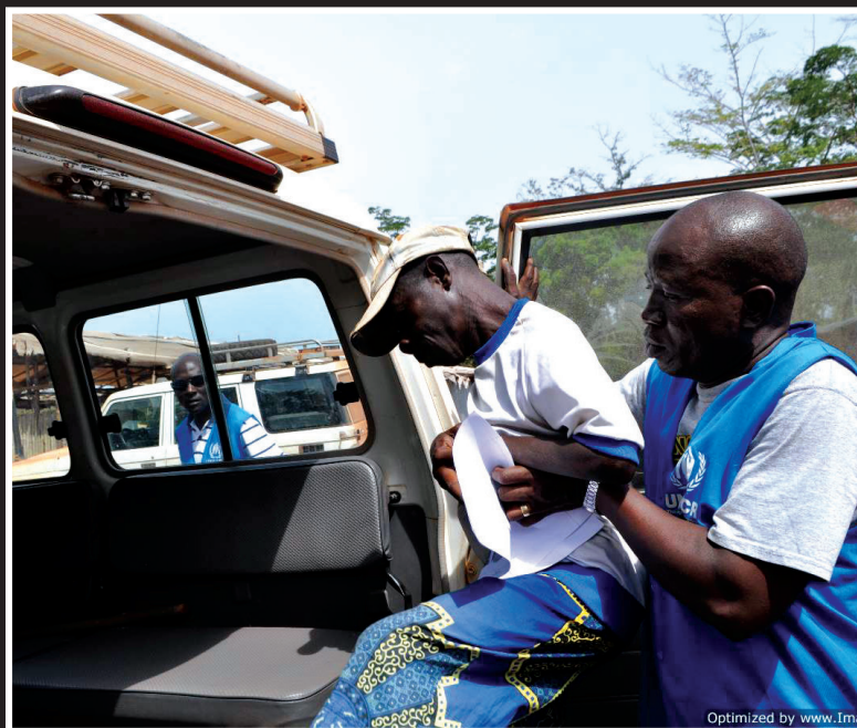
UNHCR staff assisting a repatriating Ivorian refugee