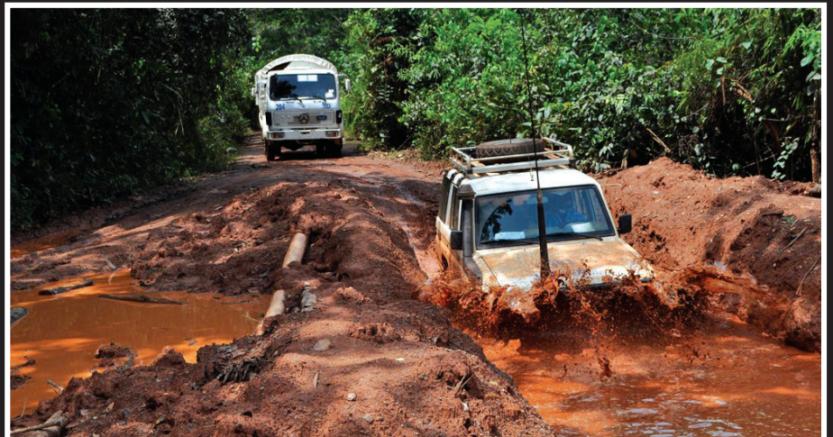
Toe Town-Bhai Border Road before rehabilitation