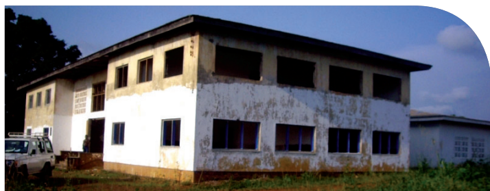
School before rehabilitation.