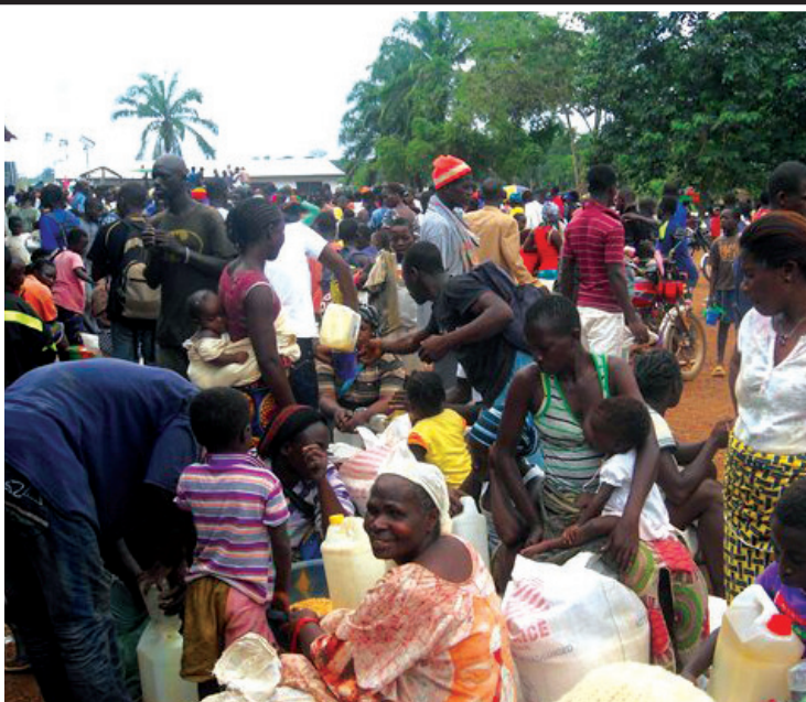
Food distribution at PTP Refugee Camp