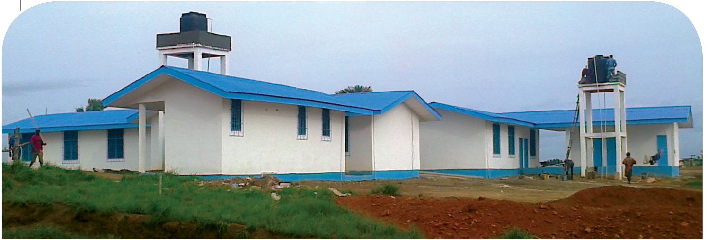
UNHCR-constructed clinic at Little Wlebo Refugee Camp, Maryland County