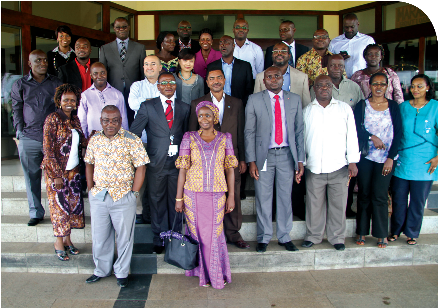
UNHCR staff at the Strategic Retreat in Monrovia