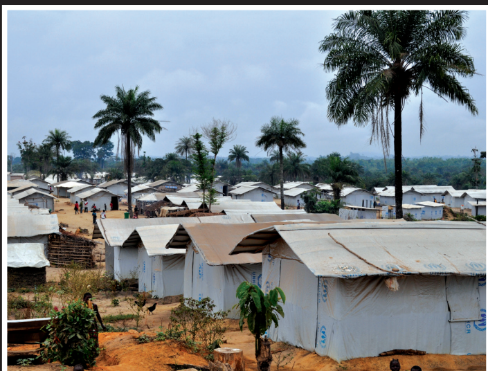
Bahn Refugee Camp - Nimba County