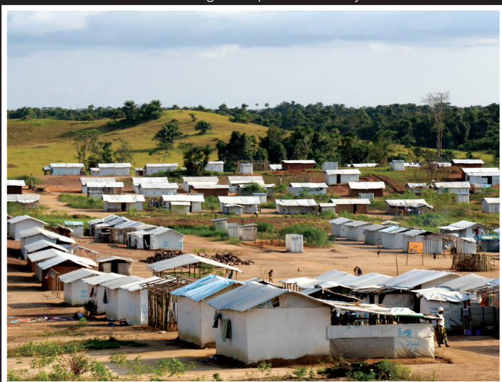
Little Wlebo Refugee Camp - Maryland County