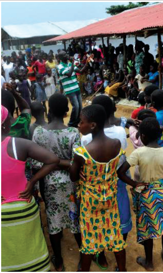
A mass information campaign in Little Wlebo Refugee Camp