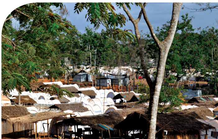
Dougee Refugee Camp closed in March 2013