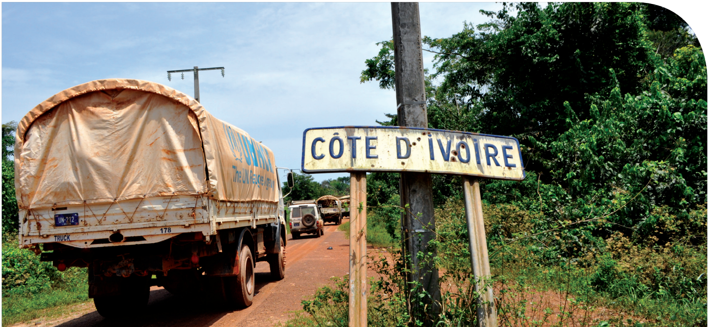
Repatriation convoy crosses into Côte d'Ivoire