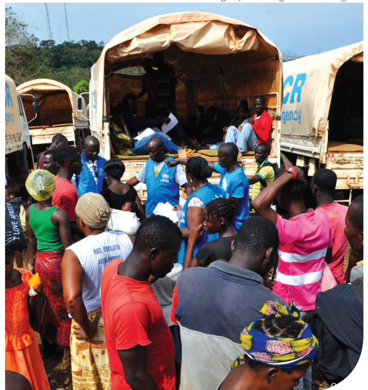
UNHCR staff assisting repatriating Ivorian refugees