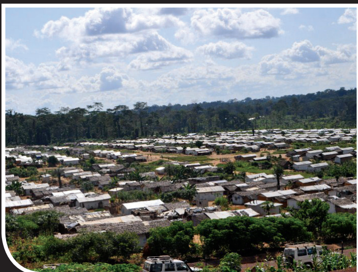
PTP Refugee Camp - Grand Gedeh County