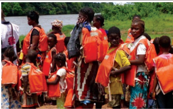
Repatriating Ivorian refugees in Maryland County