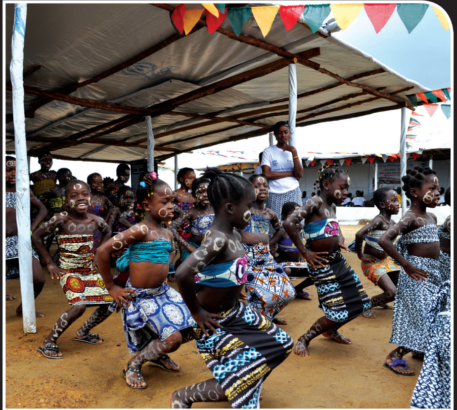
Ivorian refugee children on World Refugee Day