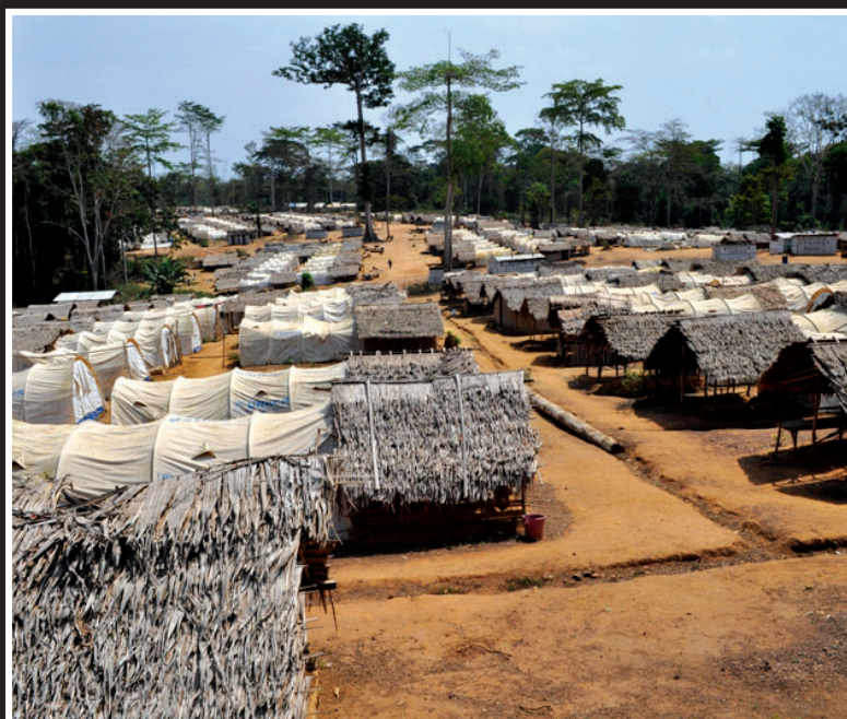
Solo Refugee Camp - Grand Gedeh County (To close in 2014)