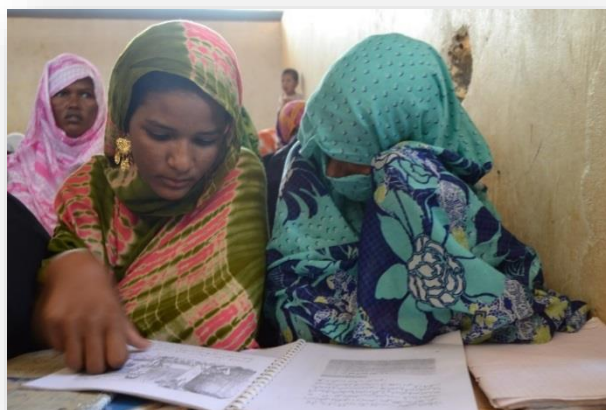
Arabic alphabetization class in Mberra Camp.