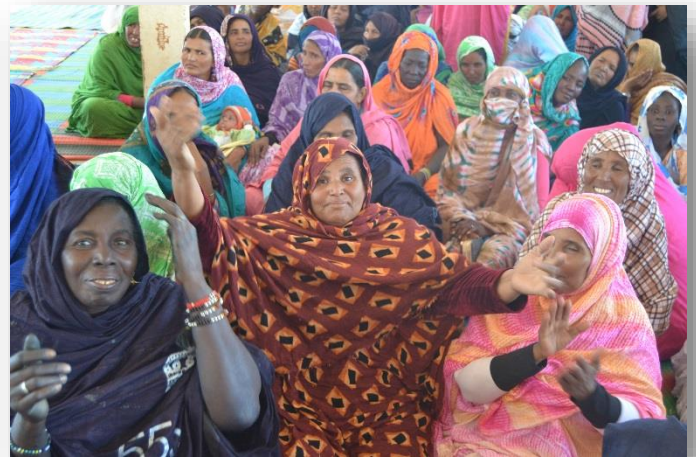
16 Days of Activism campaign Launch in Mberra camp