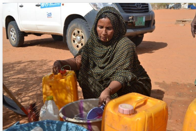
Rinsing jerrycans as part of proper water and hygiene practices in Mberra Camp.