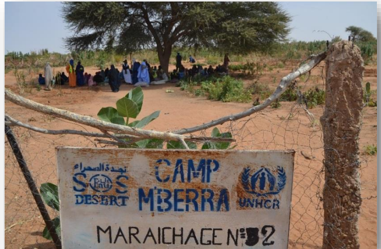
Gardening fields in Mberra Camp.