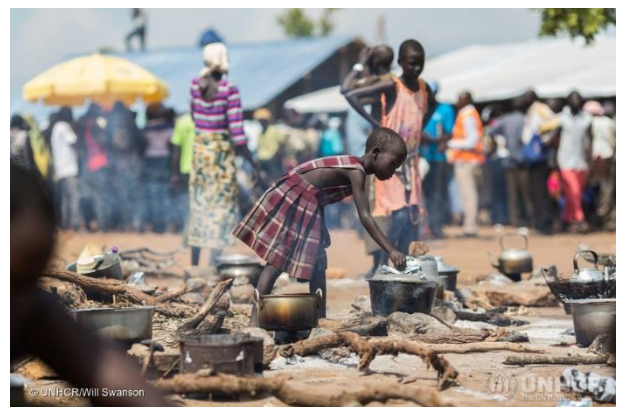
A young refugee girl who fled the fighting that began on 7 July 2016 in South Sudan, checks her pot of food at the newly established Pagarinya 2 camp in Adjumani District, northern Uganda.