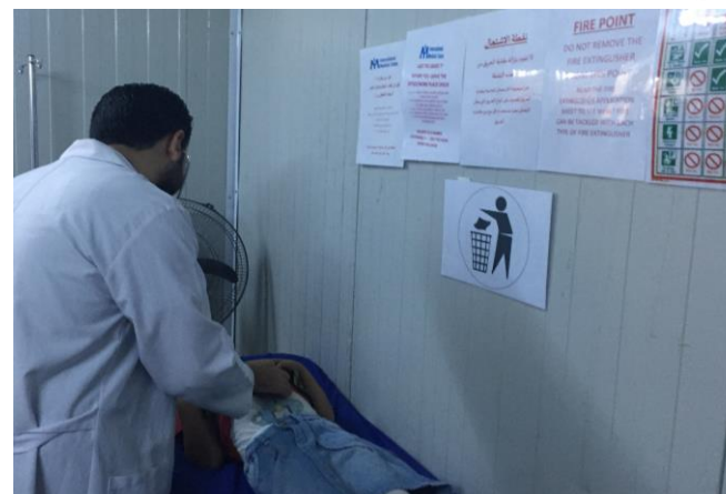
IMC medical doctor examining a patient at Darashakran camp PHC, Erbil